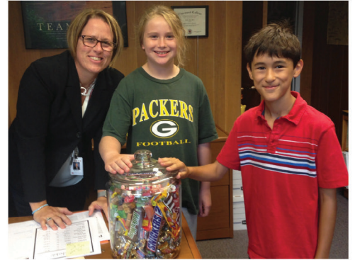
They both guessed 480 pieces!

Parent Teacher Conferences are coming soon and in an attempt to make it easier for parents and guardians to schedule their conference, we are piloting the use of the online program called Signup.com. Within minutes of our release, we had two dozen parents/guardians signing up for the conference time of their choice! We hope this will continue as we prepare for our first conference date of October 20.