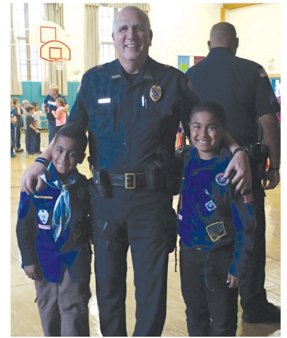
Thank you, Fox Point Police Department!

We would like to thank the Fox Point Police Department, the Fox Point DPW, and Riteway Bus Company for helping to ensure