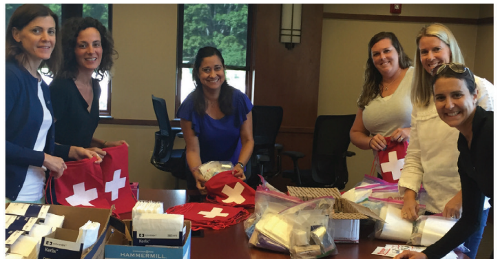
Volunteers assemble Classroom Care Kits.