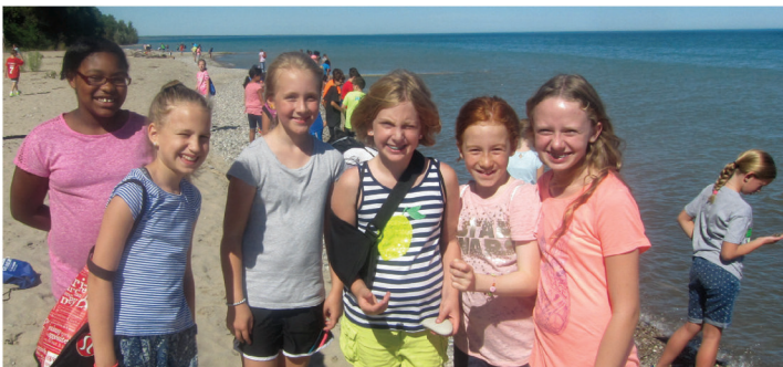
5th grade at Doctors Park.