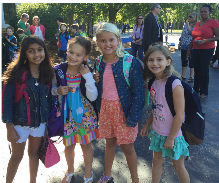
Back to school at Stormonth.