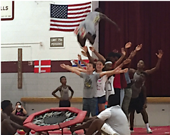
Milwaukee Flyers visit BMS.

We have had a great start to the year at Bayside Middle School with many exciting events! On the second day of school, Bayside teachers and students celebrated our PBIS (Positive Behavioral Intervention Supports) kickoff with the Milwaukee Flyers. The Flyers are a non-profit organization whose purpose is to provide a positive outlet for youth. Their message was filled with inspiration and wonder as we watched their hard work and commitment to training come to life through their amazing tumbling routines. Our gym was bursting with excitement as we celebrated our new school-wide behavioral program.